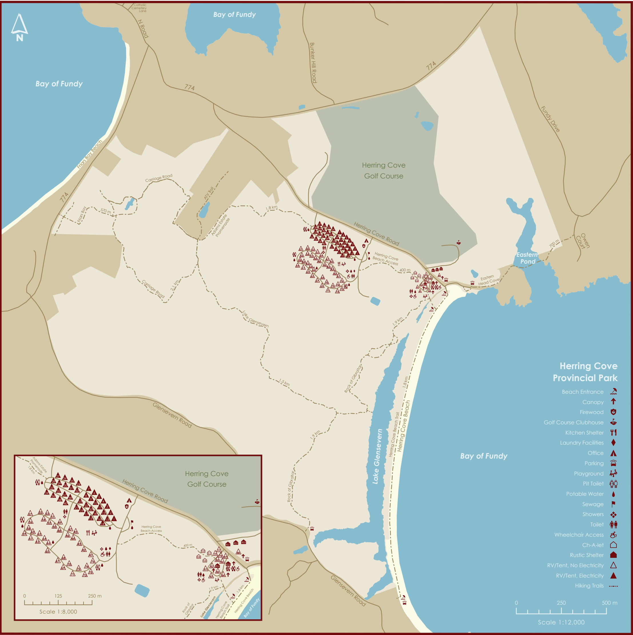
Full Colour – Contemporary

This map uses a complementary colour scheme to create a vibrant contrast, giving the map a playful feel while maintaining a sense of professionalism. The creamy feel of the blue water and the deeper blue icons helps to soften the contrast against the light orange backdrop. This works well with the Comic Sans typeface, which adds to the informal mood. The unconventional scale bars and north arrow diagrams also contribute to the casual, lighthearted theme.