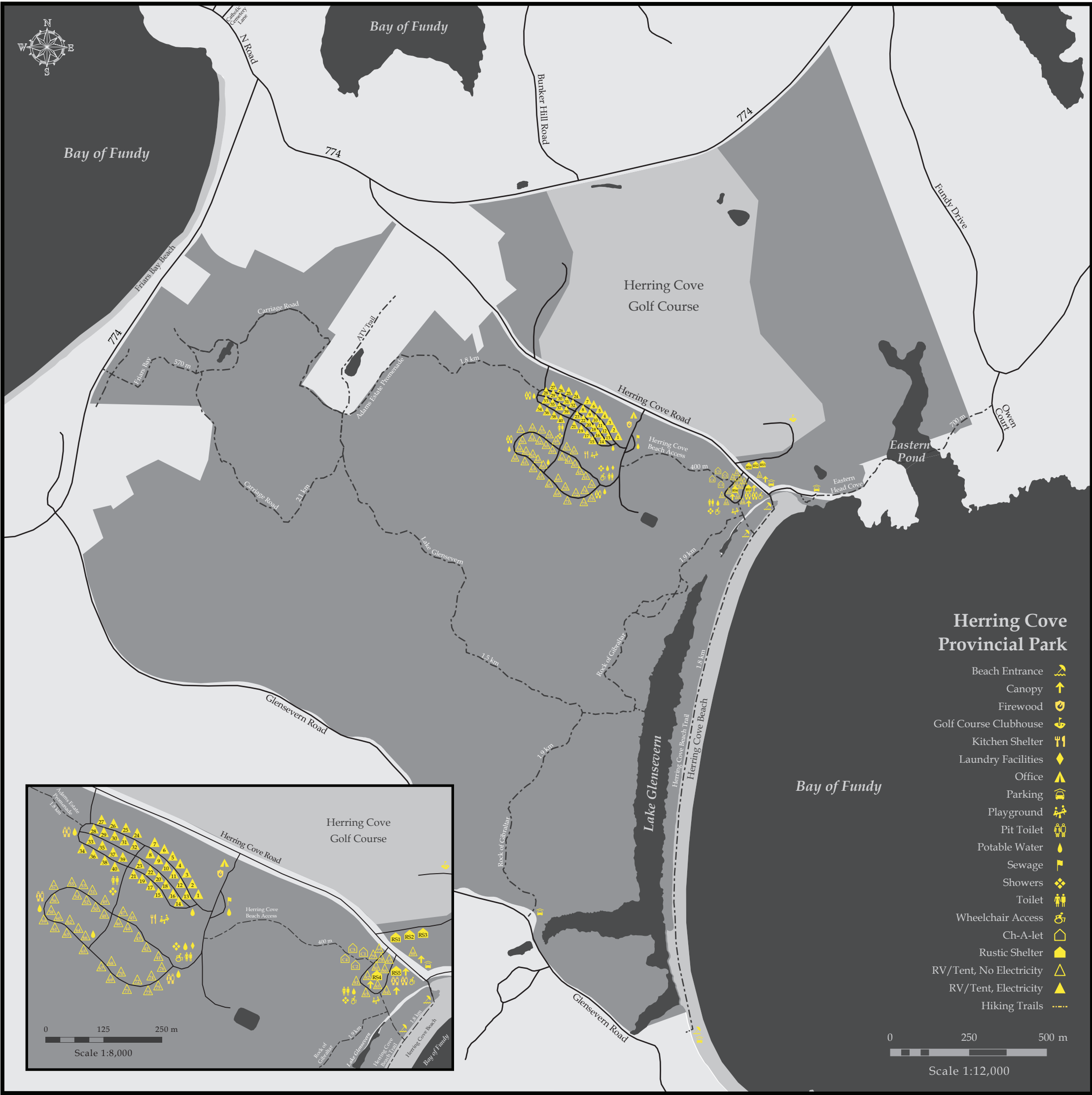
Achromatic (+1) – Historic

This map has an achromatic colour scheme that creates contrast by utilizing darker shades for water and lighter ones for land. A bright shade of yellow acts as the plus-one for the icons to create an even greater contrast, emphasizing them as the main focal points. The Book Antiqua typeface complements the greyscale to give the map a traditional, historic feel with its gentle, elegant serif. The italicized version used to label water gives these features a certain “flow”. The traditional characteristics of the scale bars and north arrow diagrams give an added touch to the antique feel.